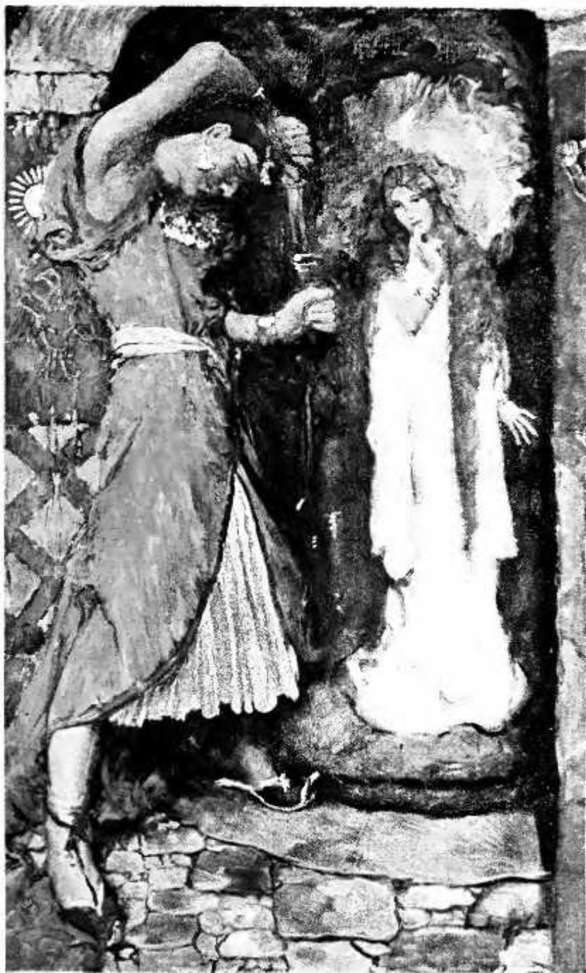
"Demetrios wrenched the sword from its scabbard"