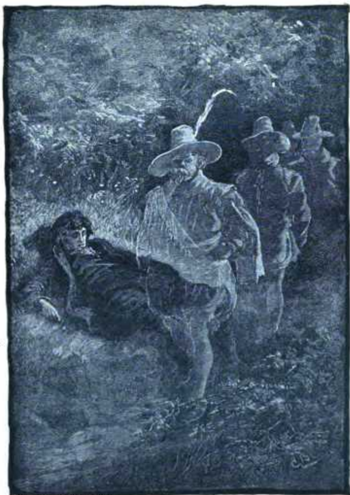
Frontispiece—Bip van Winkle