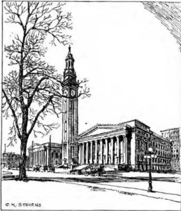
CIVIC CENTER, SPRINGFIELD, MASS.