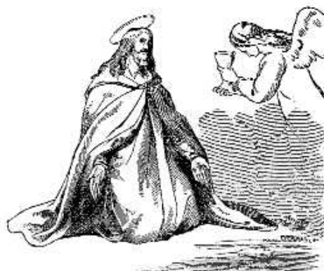
Luke, xxii, 43.