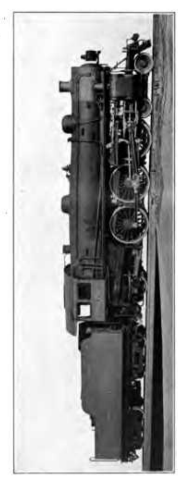
The Pacific type of passenger locomotive. This type of locomotive is used by railroads entering Cleveland. It has driving wheels over seven and one-half feet in diameter, weighs 86 tons on the driving wheels, has a water capacity of 7,500 gallons and a fuel capacity of 12 tons