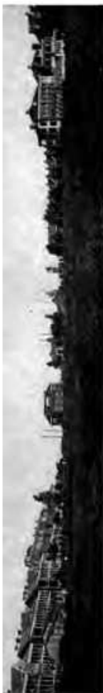
Orville Wright's Flight at Fort Myer, Va., Sept. 9, 1908.