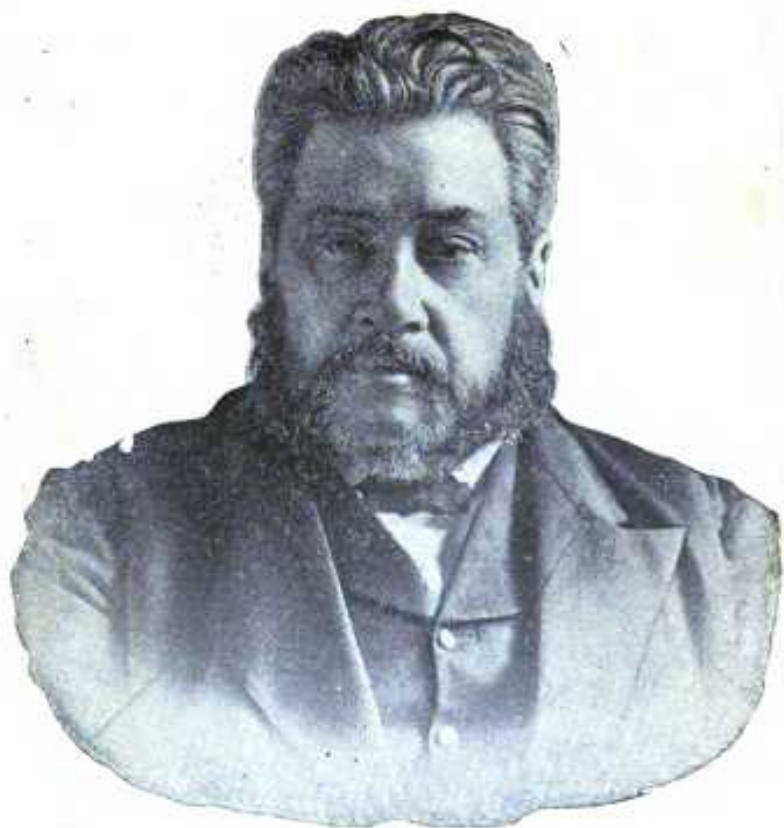
CHARLES H. SPURGEON