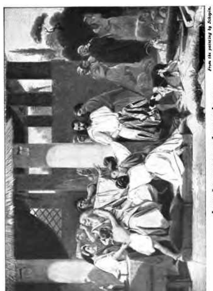
JACOB LEARNS OF THE LOSS OF JOSEPH.