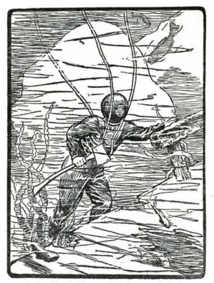
Before him he discovered the long sought hulk.