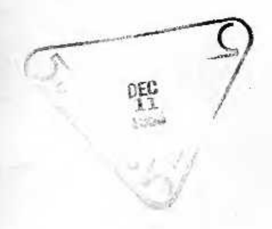
COPVRIGHT, By A. C. McClurg and Co. A.D. 1890.