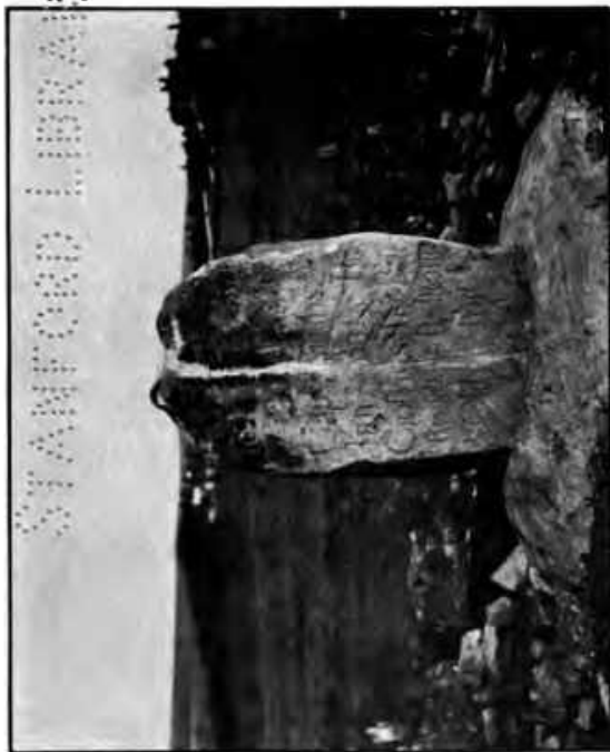
A MILESTONE ON BRADDOCK'S ROAD