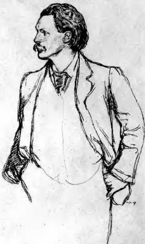
George Lissing. from the Lithograph by William Rothenstein.