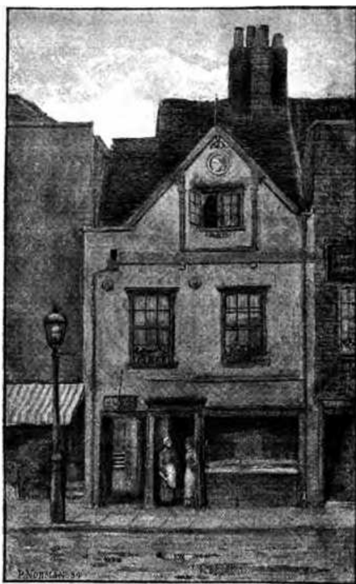
FISH SHOP IN CHEYNE WALK.