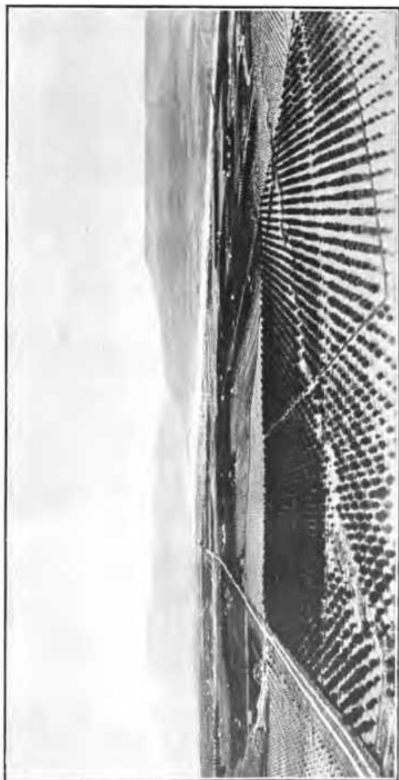
VIEW OF WENATCHEE VALLEY, WILLIAM TURNER'S RANCH IN THE FOREGROUND.