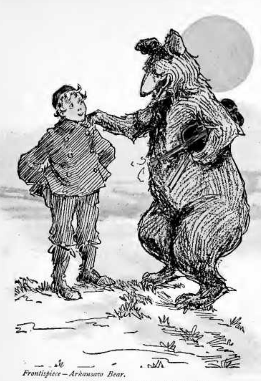
"'YOU CAN CALL ME RATIO, TOO, SEE?""