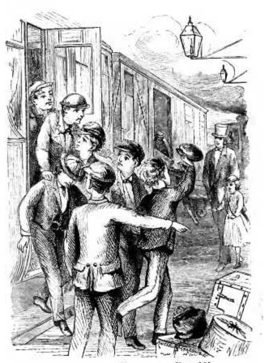
HOME FOR THE HOLIDAYS. -Page 181.