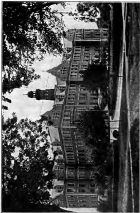
SAINT MARY'S COLLEGE