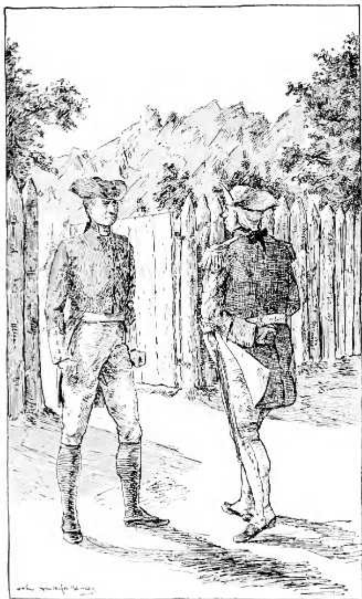
"A COLONEL SHOULD NEVER ASSUME COMMAND OF ANY BODY WHICH HE CANNOT CONTROL."—Page 77.