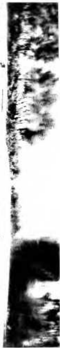
MT. PLEASANT AND MT. PROSPECT