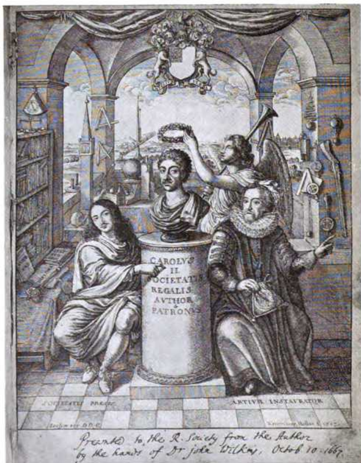
FROM AN ENGRAVING BY W. HOLLAR