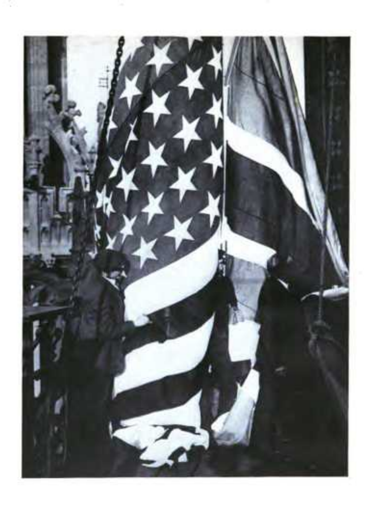
"GETTING TOGETHER" HOISTING THE STARS AND STRIPES AND UNION JACK FROM THE SAME FLAGSTARF OVER THE HOUSES OF PARLIAMENT, LONDON, APRIL, 1917.