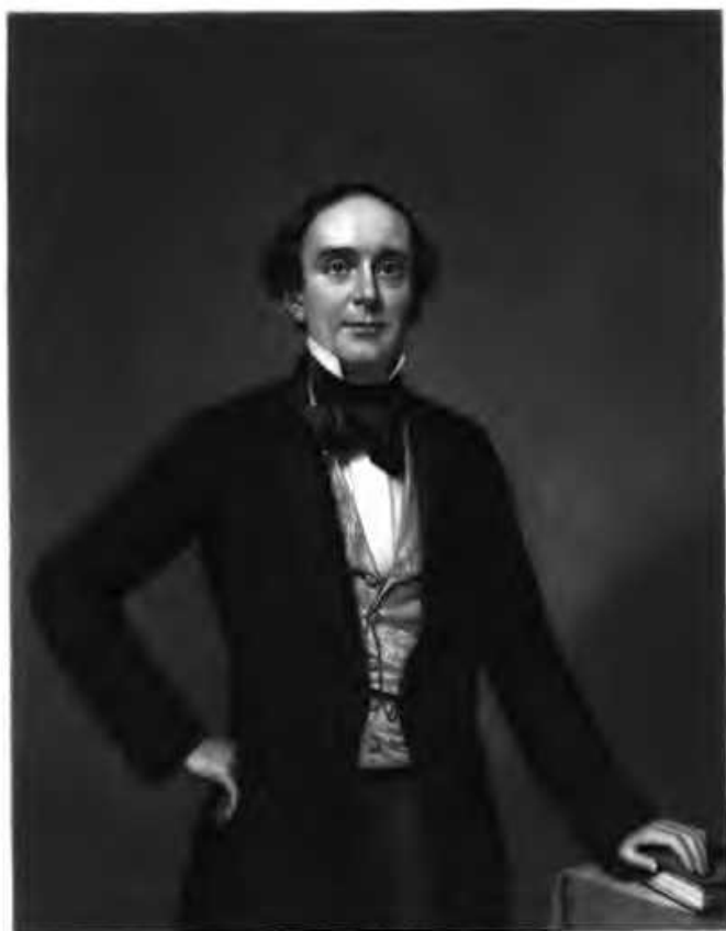
Engraved by John Sartain, after a portrait by T. S. Arthur.