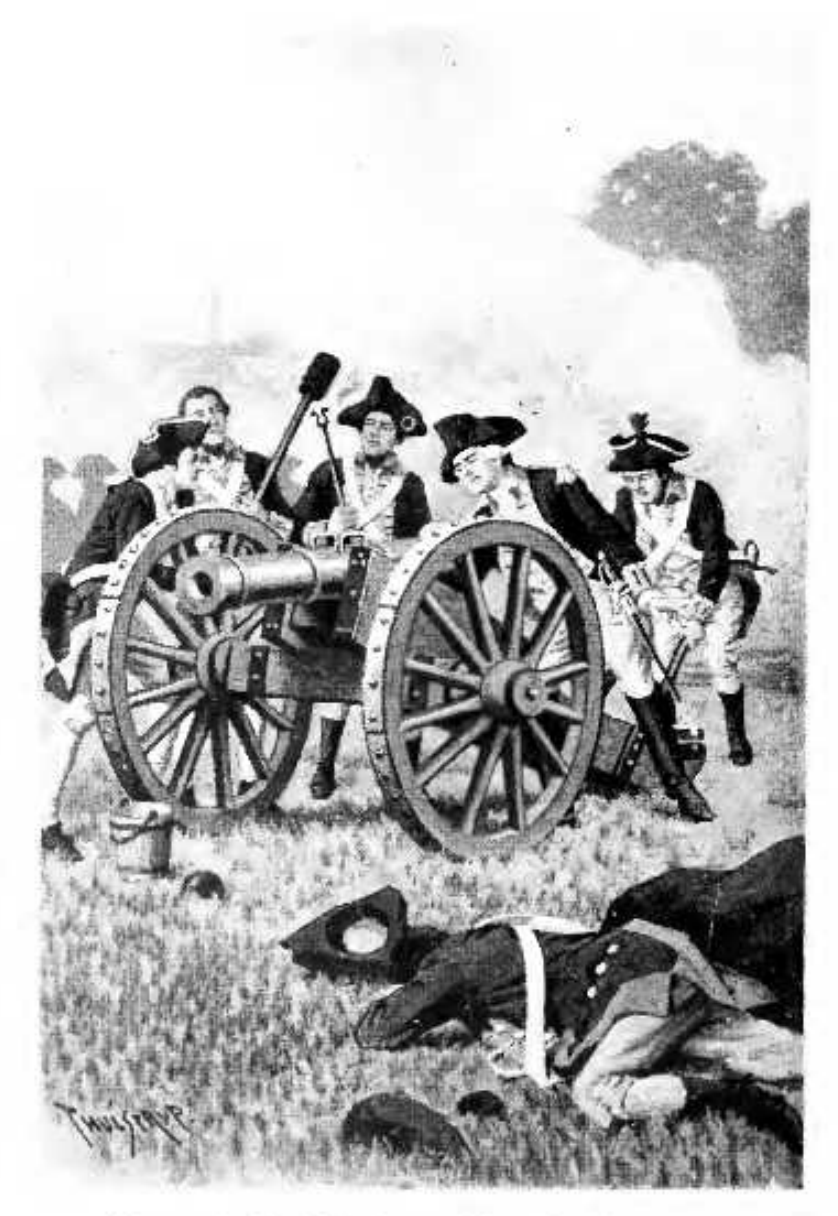
"" Wayne aimed and fired one of the field pieces himself." [PAGE 71]