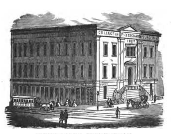
PRESENT EDIFICE-OCCUPIED IN 1856.