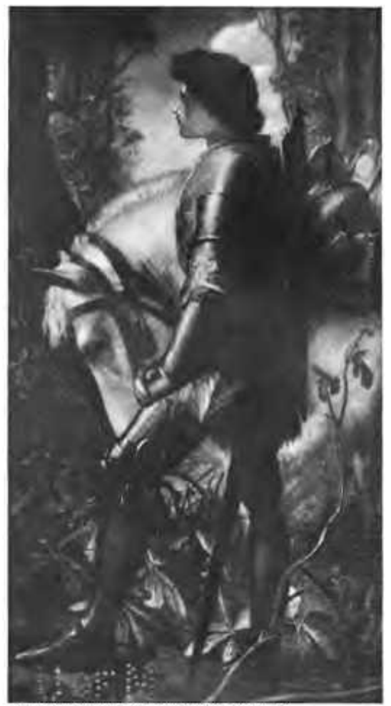
FROM THE PARTING BY GEORGE PREDERICK WATTS