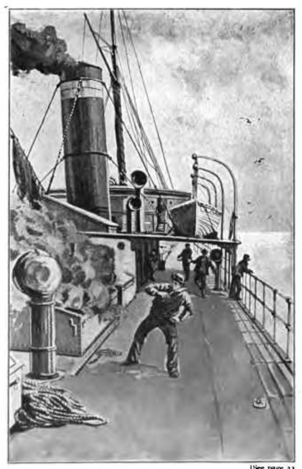
"A THICK CLOUD OF BLACK SMOKE POURED FROM THE HATCHWAY"