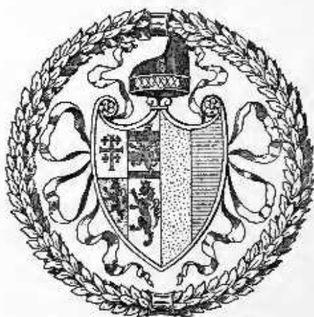
THE CORNARO COAT OF ARMS

Copyright, 1903 BY WILLIAM F. BUTLER All rights reserved