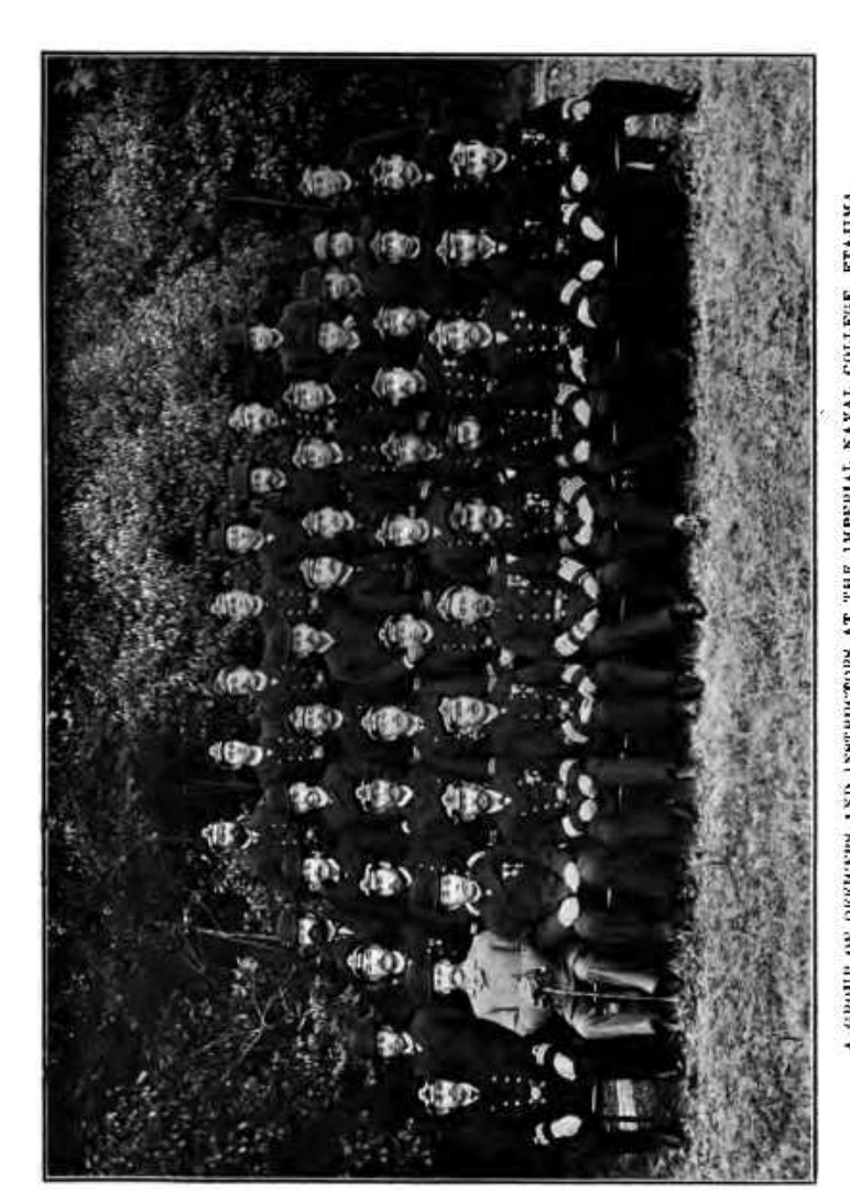
A GROUP OF OFFICERS AND INSTRUCTORS AT THE IMPERIAL NAVAL COLLEGE, ETAJIMA, WITH THE AUTHOR AMONG THEN