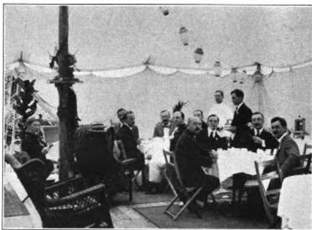
BREAKFAST IN THE TENT BEHIND HEADQUARTERS

The largest and most enjoyable reunion ever held by the Class of Ninety-five (or any other class for that matter) was its Vicennial. The men began to assemble on Saturday morning; by noon there were about thirty present and before night fifty men had arrived. Several went to the Graduates Club for lunch, after which the majority attended the ball game between the Varsity and the picked team of graduates, although a dozen or