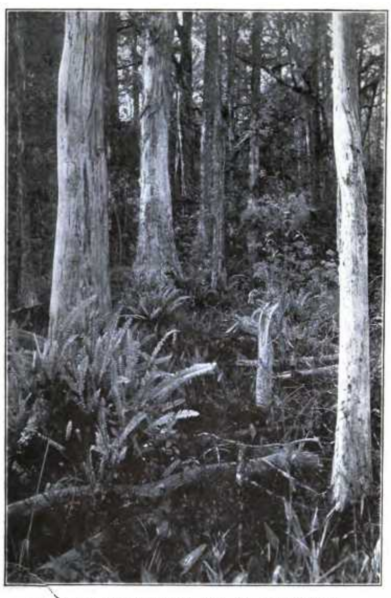
"THE TIPDED ASIDE TO THE BIG CYPRESS SWAMP"