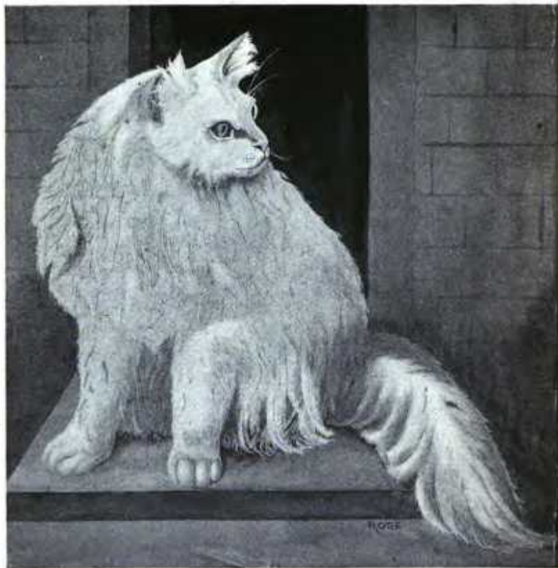
THE ANGORA CAT.