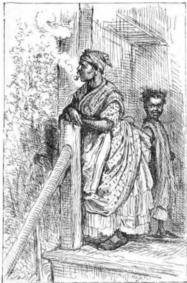
"She lighted a potent pipe." See page 22.