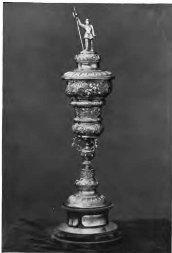
STANDING CUP (Circa 1605).