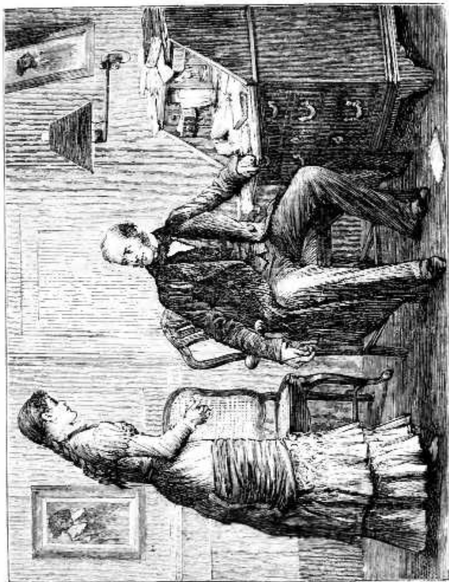
THE WELCOMED HER PLEASANTLY.—C. 39.