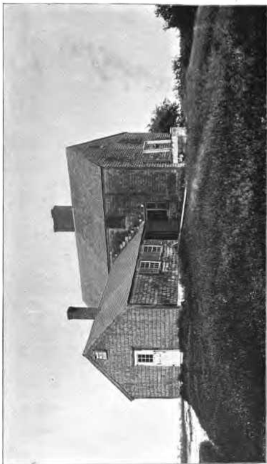
JOHN ALDEN'S HOUSE, DUXBURY, MASS. 1633.