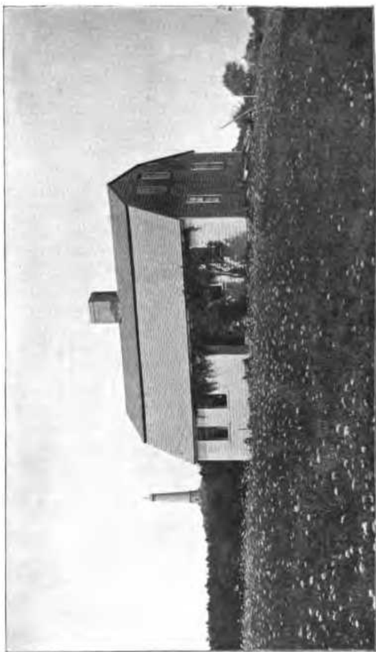
MILES STANDISH HOUSE, Duxbury, Mass., 1966.