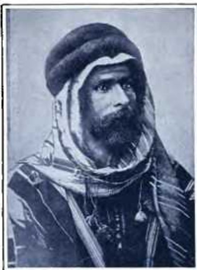
AN ORIENTAL TYPE.

The regions to be visited in the course of this Cruise are among the most beautiful, varied and interesting in the world. Along the shores of the sunny Mediterranean, where the Phœnician galleys crept from point to point in man's earliest efforts at navigation, our voyagers will sail in one of the finest examples of modern maritime construction yet produced, to visit lands famous in history and mythology, celebrated for their scenic beauty, the momentous events that have transpired within their borders, the wonderful relics of past ages they contain, and the treasures of ancient and modern art stored in their great cities. The tourists will