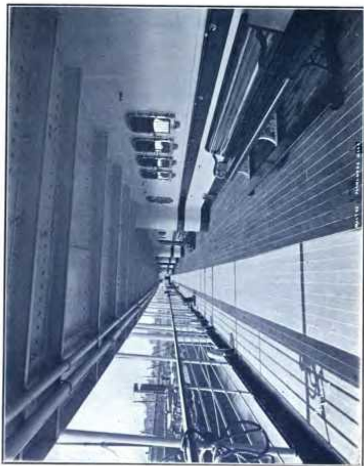
S. S. "MOLTKE."—PROMENADE DECK.