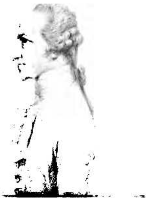
DR. T. A. ARNE.

From an original pencil drawing in the Author's possession.