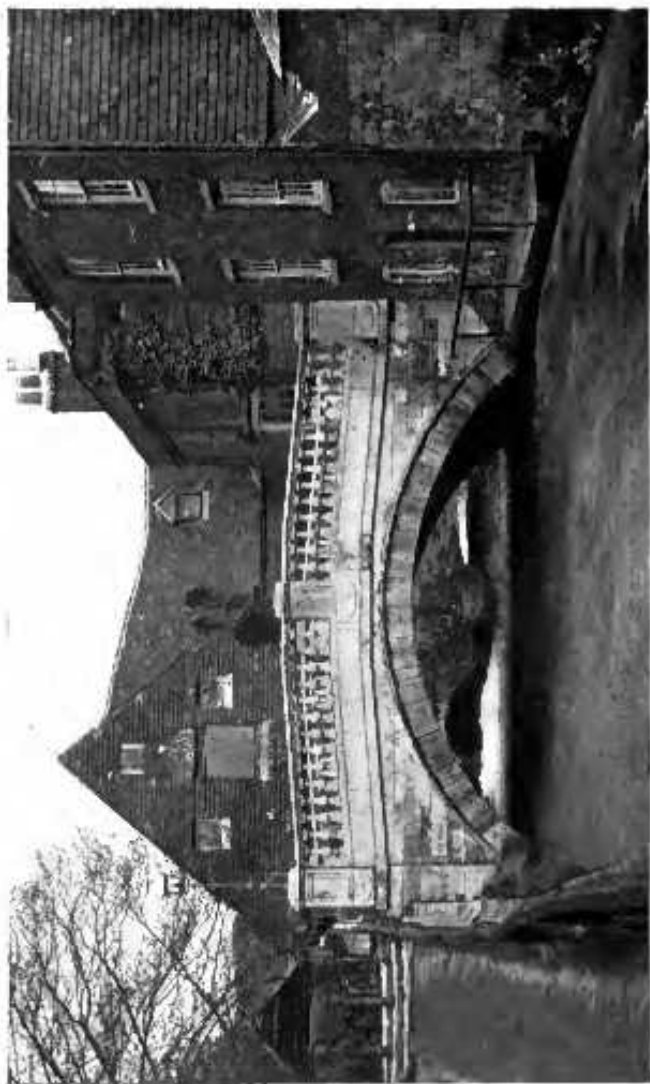
THE OLD MILL AT WINCHESTER, ENGLAND.