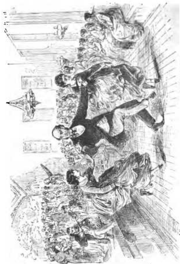
HIS NEW WIFE.—THE "WALLFLOWERS."—Page 89.