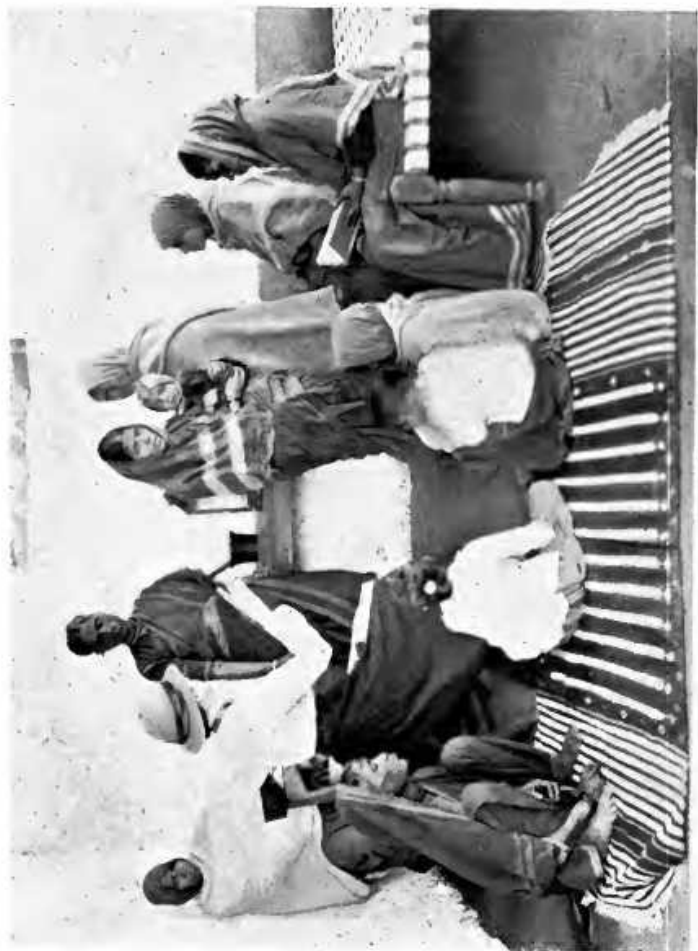
BRAHMIN WIVES AND WIDOWS.