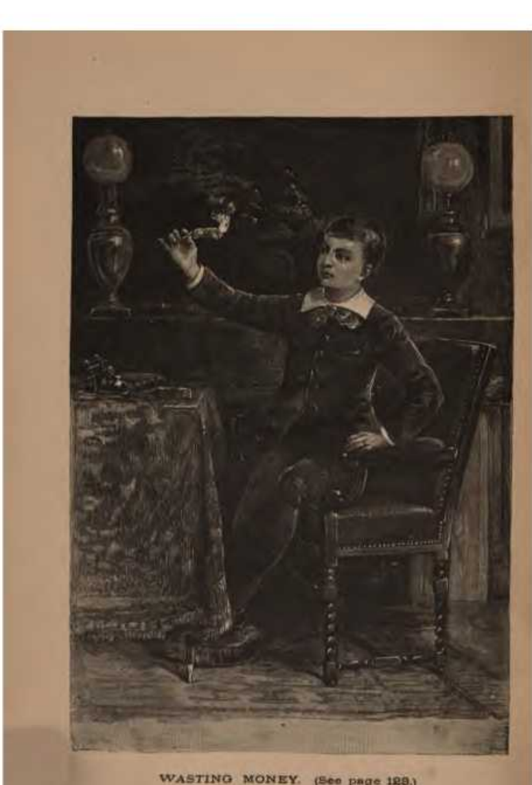
WASTING MONEY. (See page 128.)