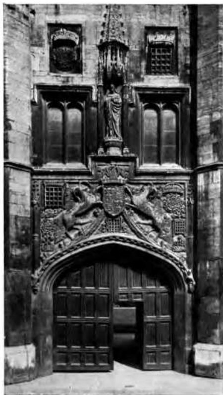
The Gatehouse, Christ's College, Cambridge (From Heraldry for Craftsmen and Designers )