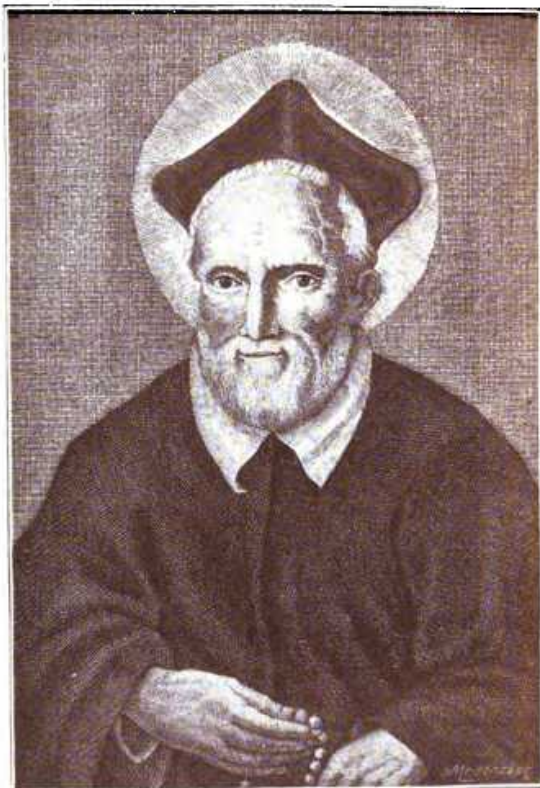
ST. PHILIP NERI, FOUNDER OF THE ORATORY.