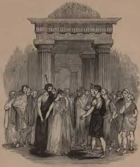
THE PALACE AT ASTIOCH II. 13.