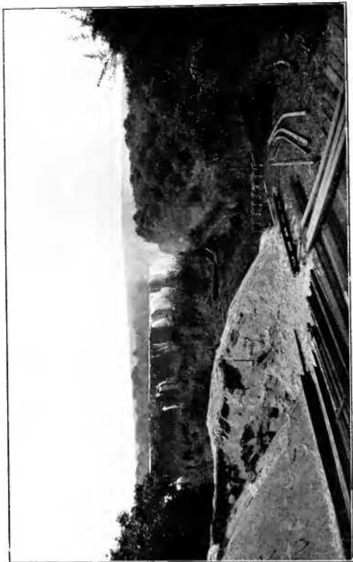
"THE OLD ORDER CHANGETH"; THE CAPE TO CAIRO RAILWAY AT VICTORIA FALLS