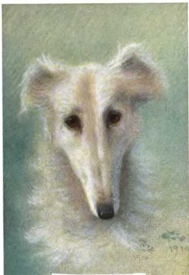
CHAMPION SORVA OF WORONZOVA