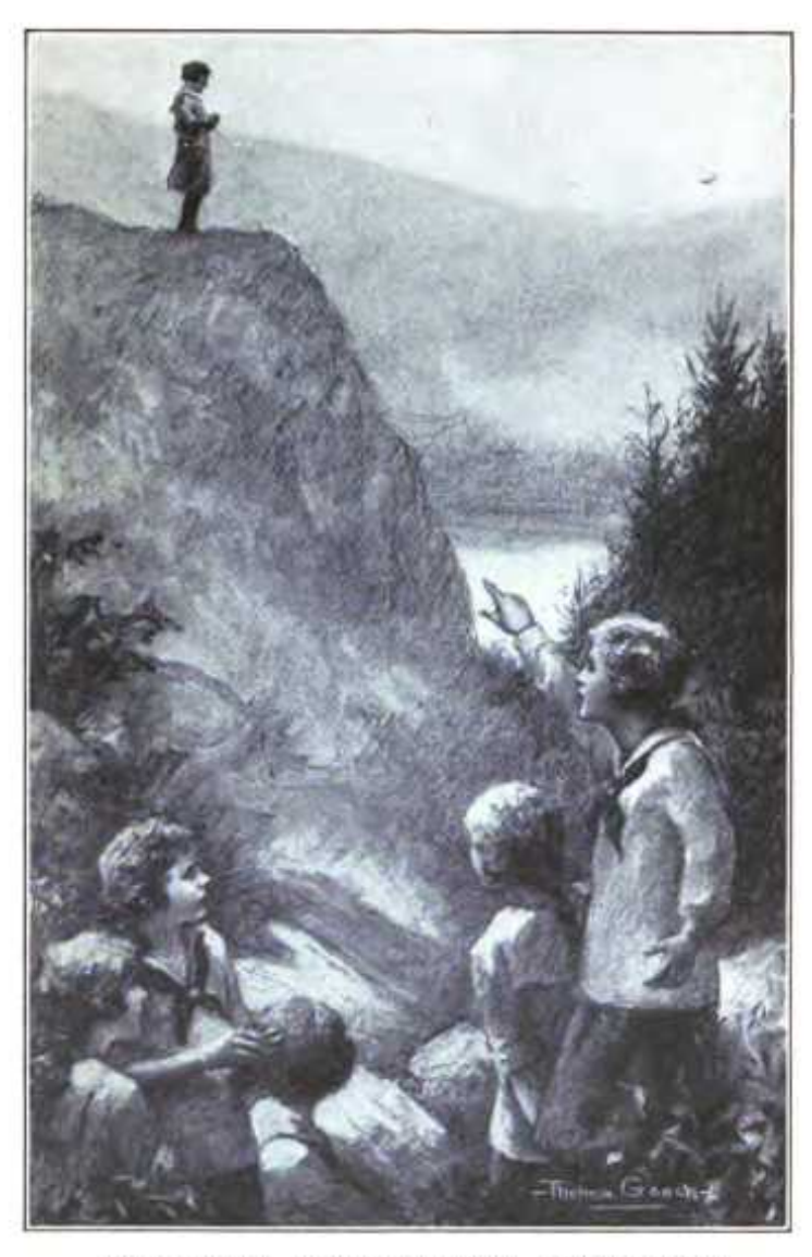
"LOOK, GIRLS! UP ON THE ROCK! THERE'S PEG!" "The Girl Scouts at Camp Comalong." Page 147