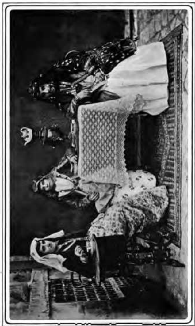
NATIVE PERSIAN TEACHERS.