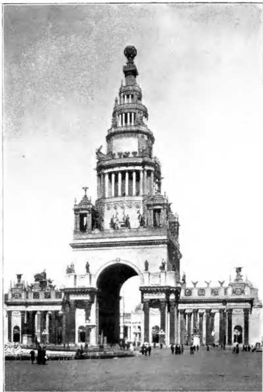
TOWER OF JEWELS, P. P. I. E., San Francisco, 1915