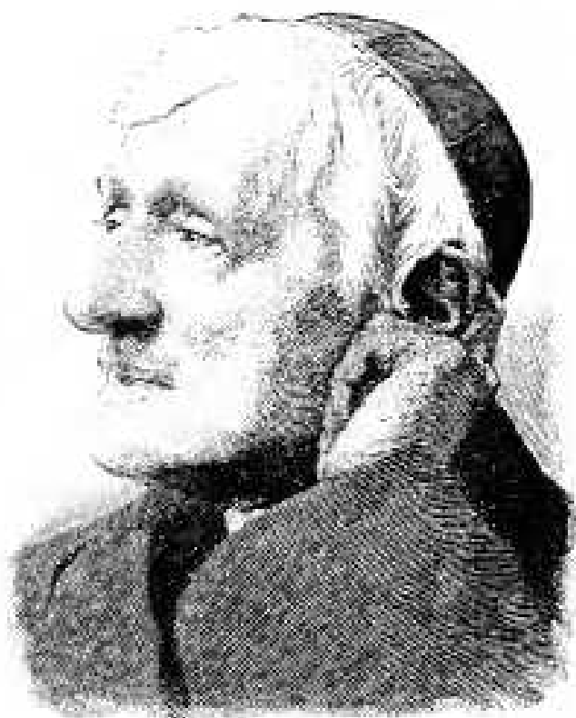
JOHN HENRY NEWMAN.